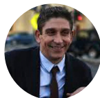
Richard Blanco United States Inaugural Poet