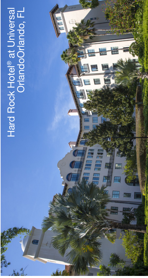
Hard Rock Hotel® at Universal OrlandoOrlando, FL

If you already received a copy of this brochure, please give this brochure to an interested colleague.