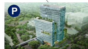
National Cancer Center Singapore