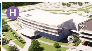
Mayo Clinic Florida Campus