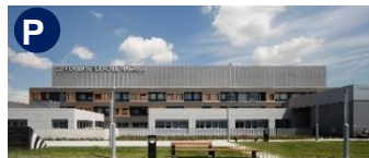
Clinica Universidad de Navarra Spain