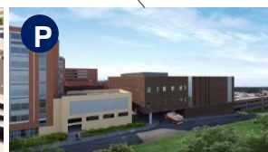
Sibley Memorial Hospital Johns Hopkins Medicine