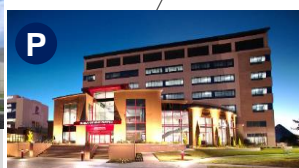
St. Jude Children's Research Hospital