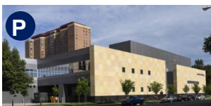
Mayo Clinic Minnesota Campus