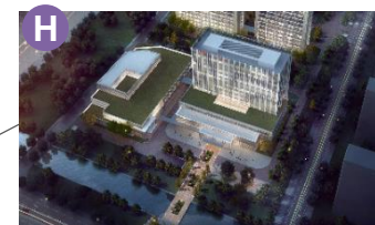
Xuzhou Proton and Heavy Ion Hospital