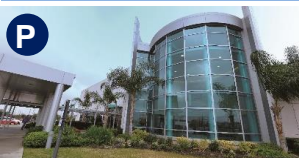
University of Texas MD Anderson Cancer Center