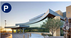
Mayo Clinic Arizona Campus