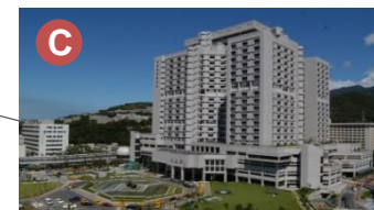
Taipei Veterans General Hospital