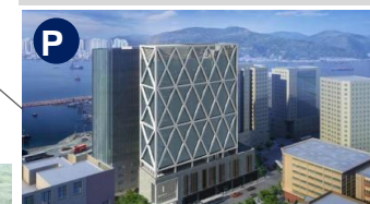
HKSH Eastern Dist. Adv. Medical Center Hong Kong