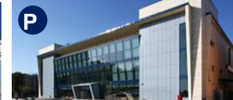
Centro Nazionale di Adroterapia Oncologica (CNAO) Italy