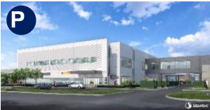
University of Texas MD Anderson Cancer Center (2nd unit)