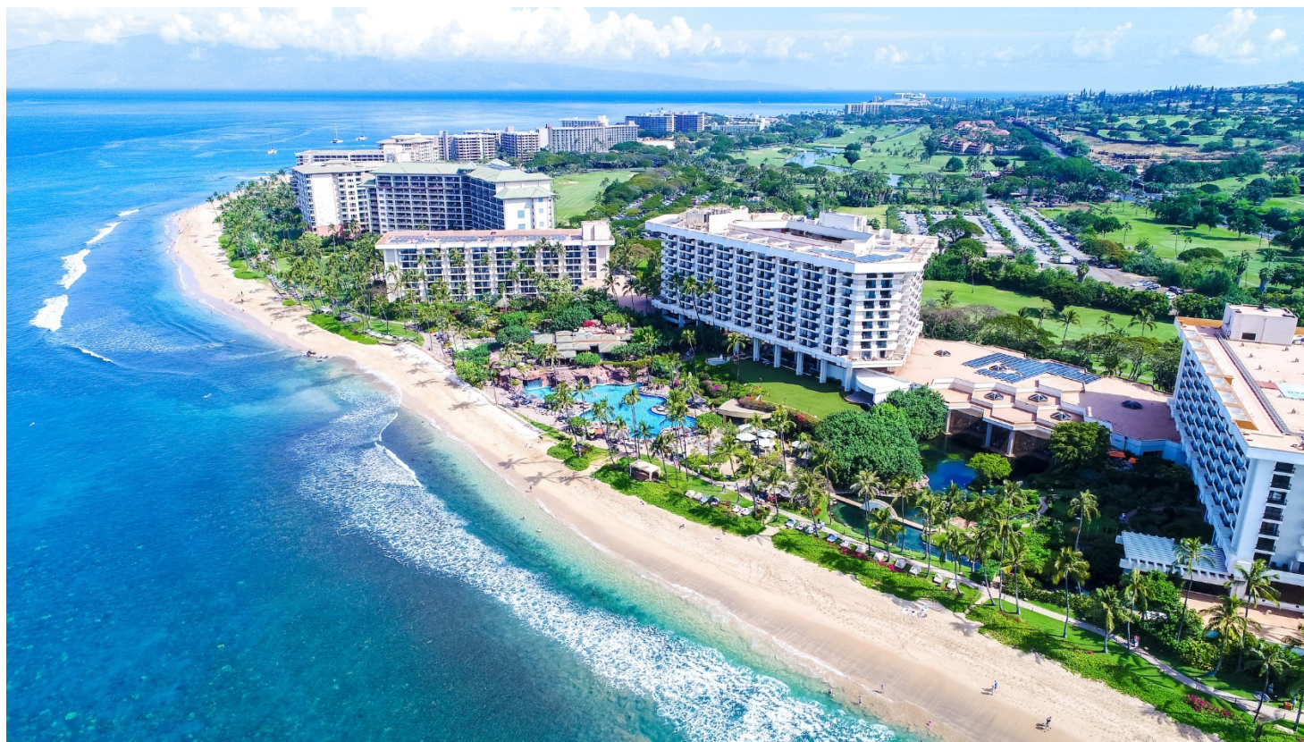
Exhibit and Sponsorship Prospectus