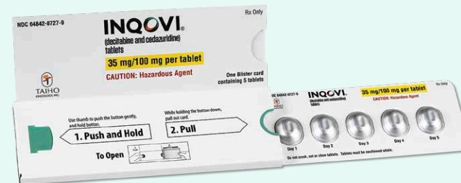
DosePak is 7.35 in x 2.45 in.