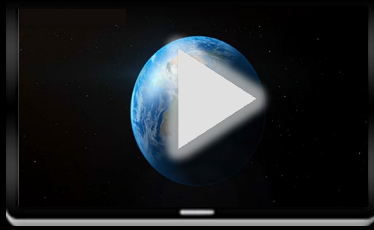
Novartis Gratitude Video