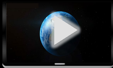
Novartis Gratitude Video