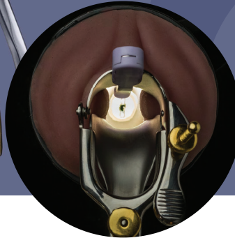
Targeted Illumination Nella VuLight Single Use LED Light avg. lux near cervix: 6,575