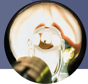
Traditional Illumination Welch Allyn 48810 Exam Light avg. lux near cervix: 2,248